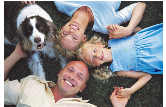
Once socialized properly, your new pet will become part of the family.

to allow them to acclimate themselves to their surroundings. Allow them to explore while the kids are away, making sure they are supervised. Slowly socializing your new pet is the key to their adjustment. Never allow your child to chase, hit, or even stare at a dog, and encourage them to only pet the animal when the animal wants to be petted. Teaching kids about the responsibility of animal care will encourage respect between them. Here at the Humane Society we have a plethora of resources available, from books to DVD's. Check it out!