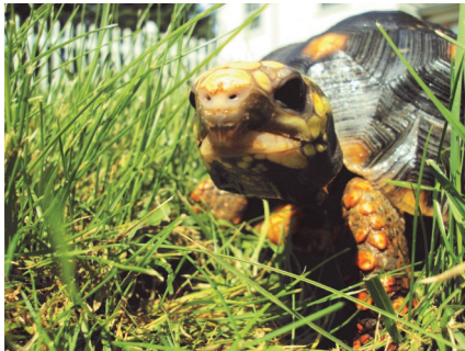
Kurma, the author's Grenada Red Footed Tortoise

If you decide on a pet tortoise too, do your research. Make a promise to your pet that you will feed them, make sure they are healthy, clean their habitat and provide special treats often. Also, remember that tortoises get BIG and live a LONG time. This is part of the responsibility of ownership, and often it is a lifetime commitment. Taking them to a zoo or turning them lose is unacceptable, because they will struggle to adjust and often will not be able to fend for themselves. If you are a responsible tortoise owner, you understand that you are in this for the long haul!